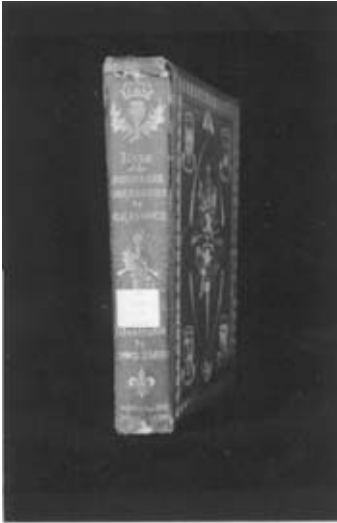
Aytoun, Lays of the Scottish Cavaliers (Edinburgh, 1863)