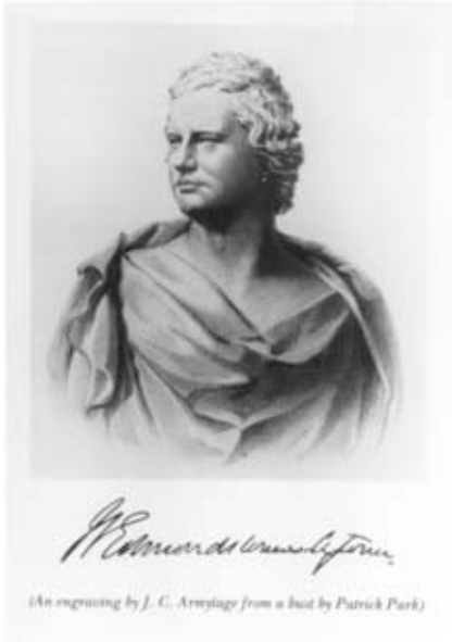
William Edmondstone Aytoun