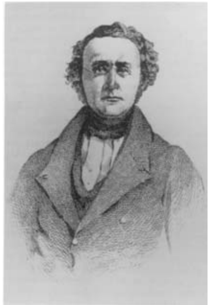
George Gilfillan in Nineteenth-Century British Literary Biographers (Detroit: Gale, 1994), p. 144